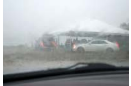
Where Did The Bay Go?