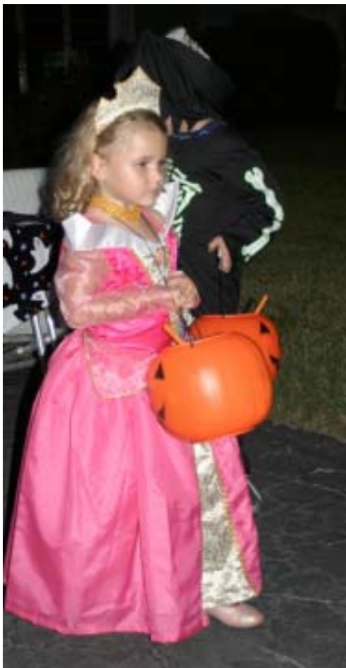
Fair-haired Princess strides off with her loot