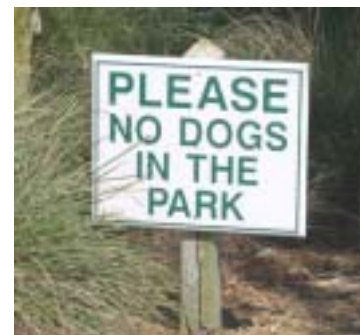
Naples' Dog Mess Solution ?

Dogs seem to be the biggest problem we have.